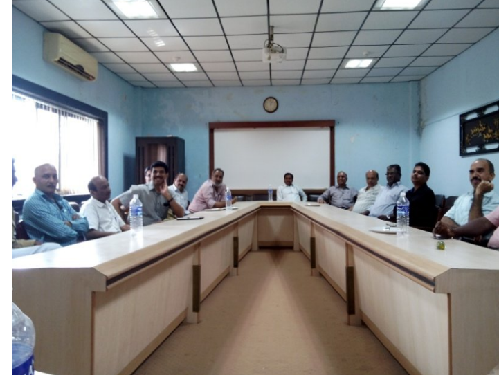
Meeting in O/o ADG(E), West Zone, 18.11.14