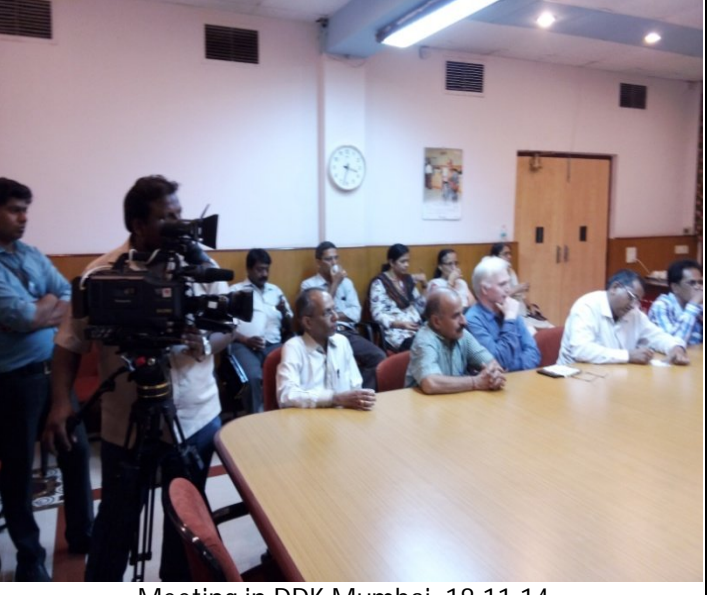
Meeting in DDK Mumbai, 18.11.14