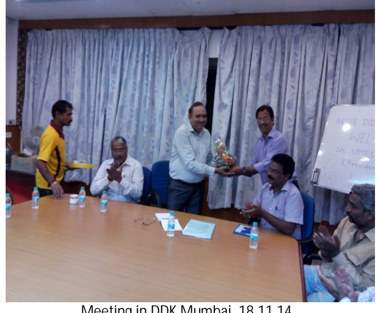
Meeting in DDK Mumbai, 18.11.14