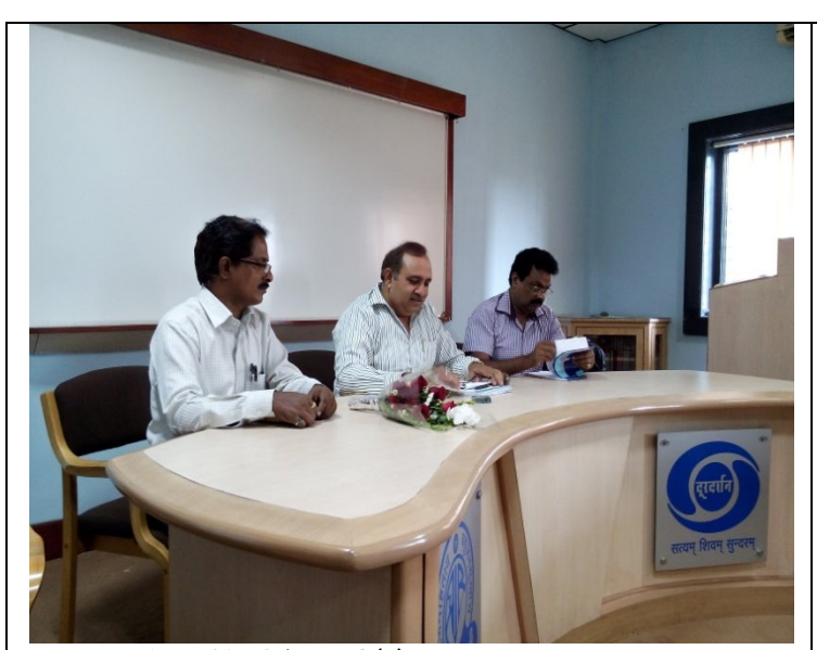
Dias of in O/o ADG(E), West Zone. 18.11.14

During the tour to Mumbai, President, ARTEE conducted four Meetings in O/o ADG (E) WZ, DDK Mumbai, AIR HPT Malad and VBS Borivali Mumbai. President, VP (WZ) and Zonal Office bearers addressed the these meetings, which were attended by a large number of Members who raised queries and got their Reply. DDK Mumbai meeting covered by Sahayadri Channel.