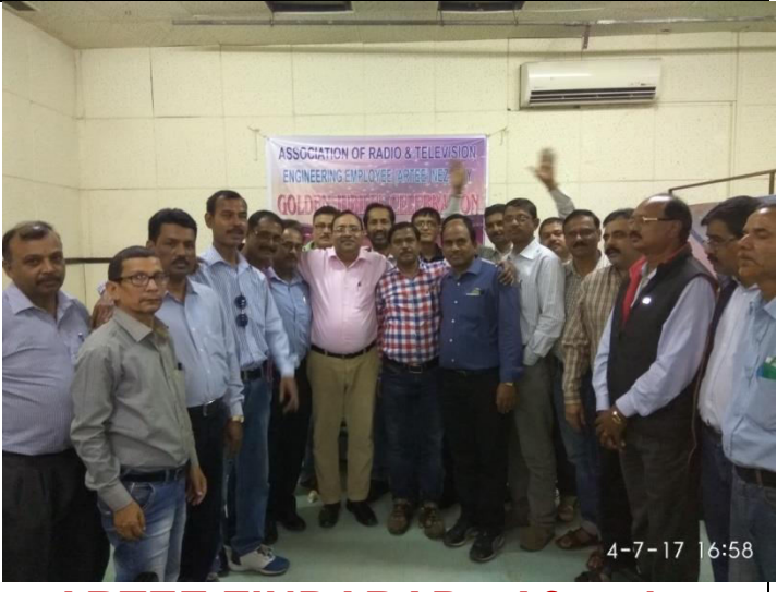
ARTEE ZINDABAD - After the function