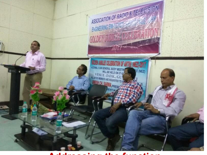
Addressing the function