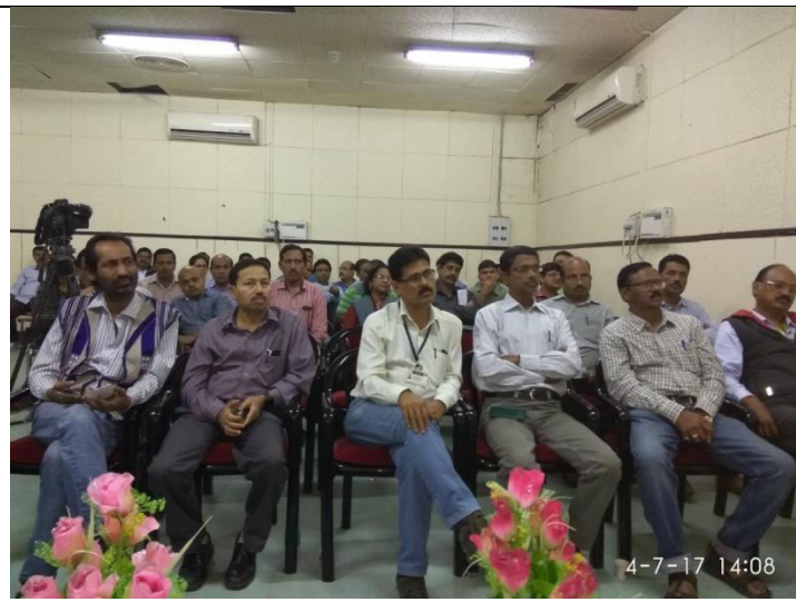
Gathering of the function.